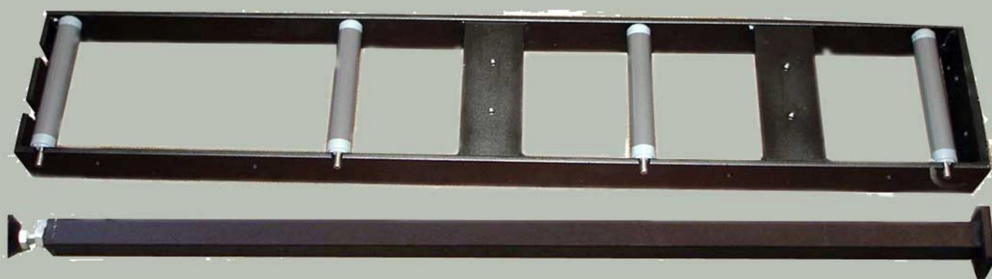
Extra Roller Infeed Table, w/Supporting Leg, No. 0977EX (to 'click-on' No. 0977)