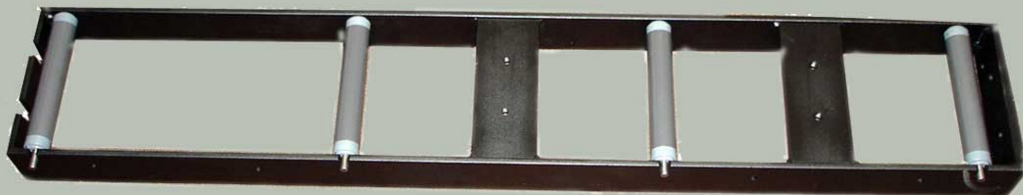
Rollter Infeed Table, Section 1, left, No. 0977

Each unit comes with two shelves. One shelving unit can be attached to the extension table, thus making an easy and convenient storage of up to 3 metre long mouldings possible.