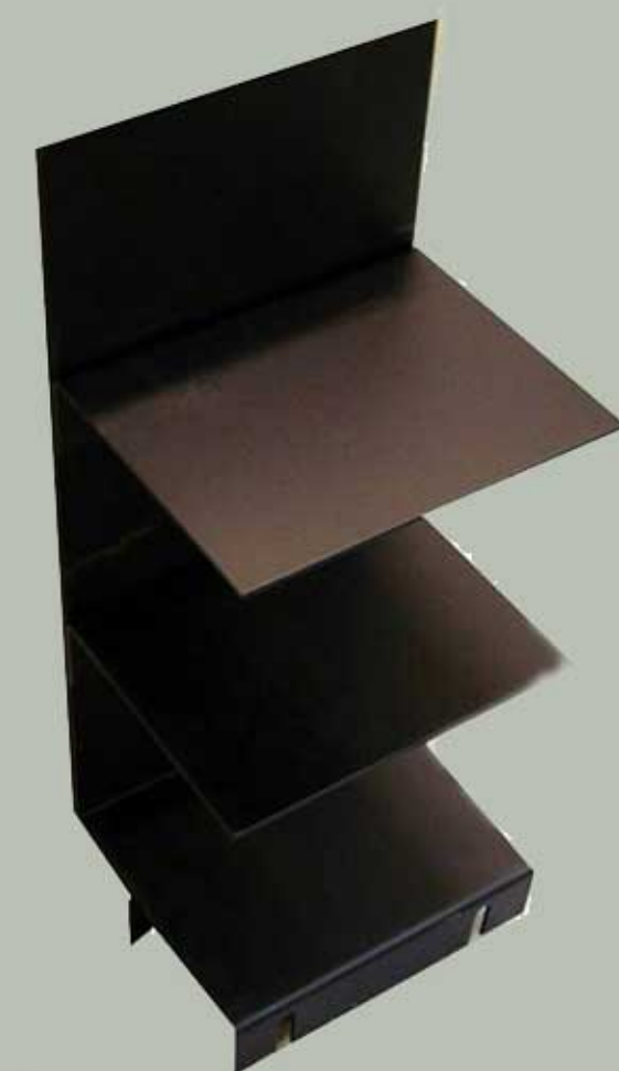
Shelving Unit No. 0976 (fits No. 0977 and 0977EX)