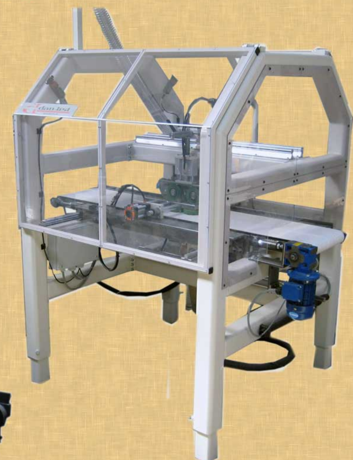
Milling Machine for blind groove in drawer sides.

Conveyor from milling machine to boring machine